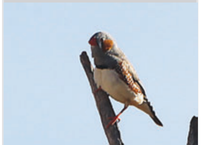
The Zebra Finch is a regular visitor to Cooper Pedy and other arid areas