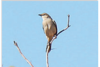
The Horsfield's Bronze Cuckoo that visits Cooper Pedy has a delightful song. This bird does not raise it's own young, but lays her eggs in the nests of other species