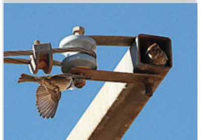
Mother sparrow takes food up to offspring inside power pole