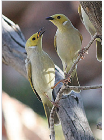
Singing Honeyeaters are seen in Cooper Pedy the whole year round